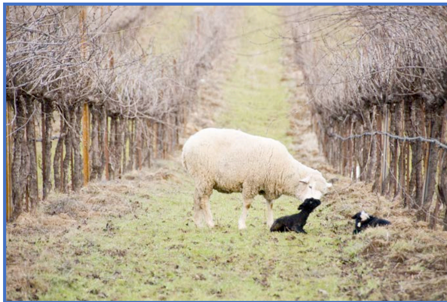
Frey Vineyards • Mendocino, CA

Agricultural production is minimally manipulated after it has been harvested. See Demeter Biodynamic Processing Standard for more information.