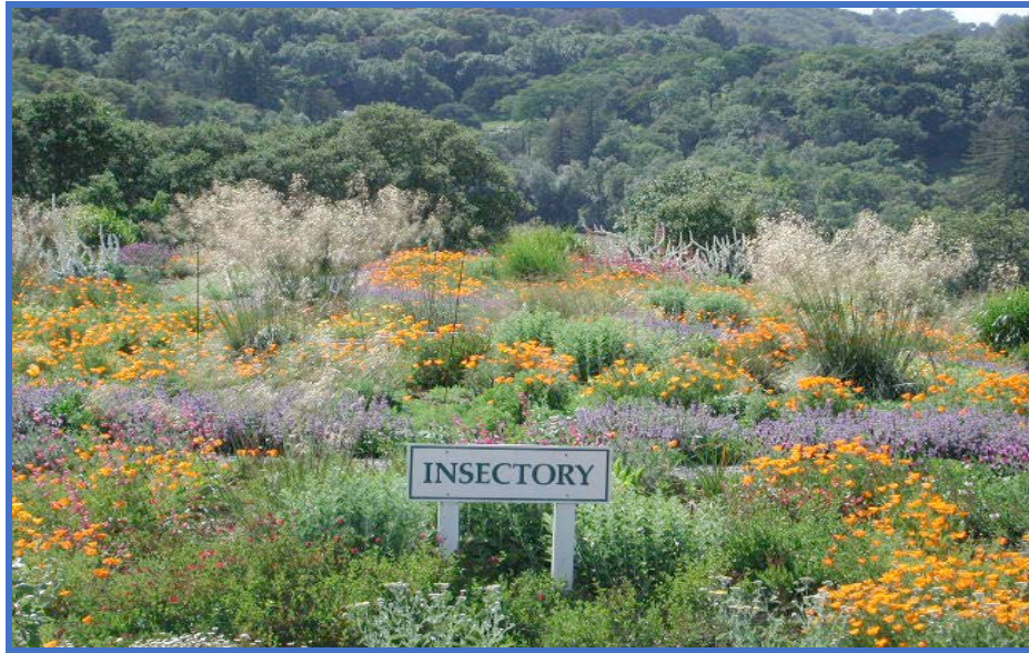
Benziger Family Winery • Sonoma, CA