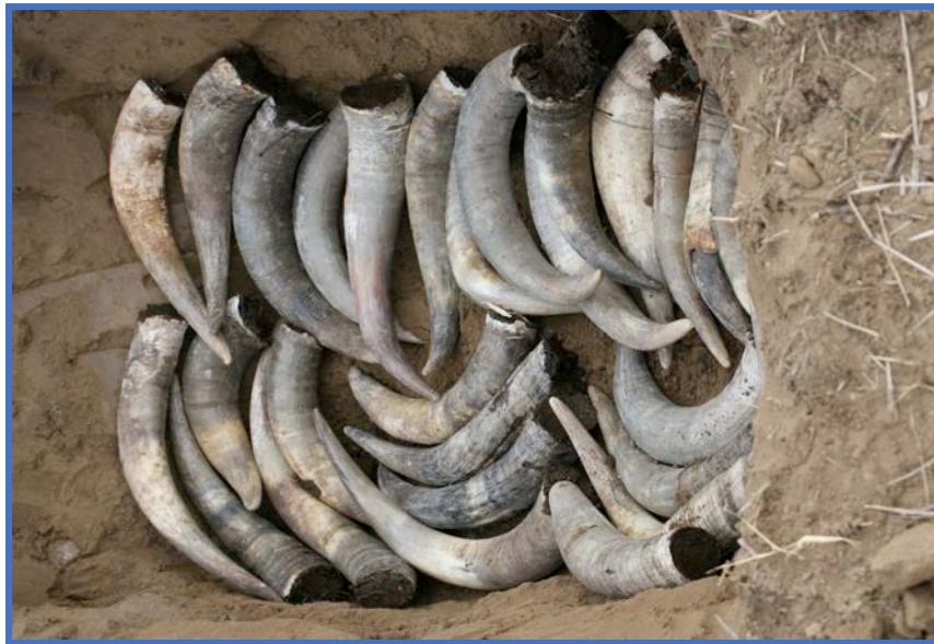
Cowhorn Vineyard & Garden • Applegate Valley, OR