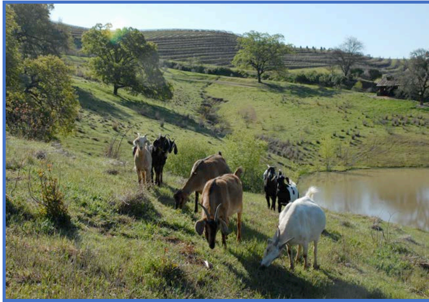
Dark Horse Ranch • Mendocino, CA