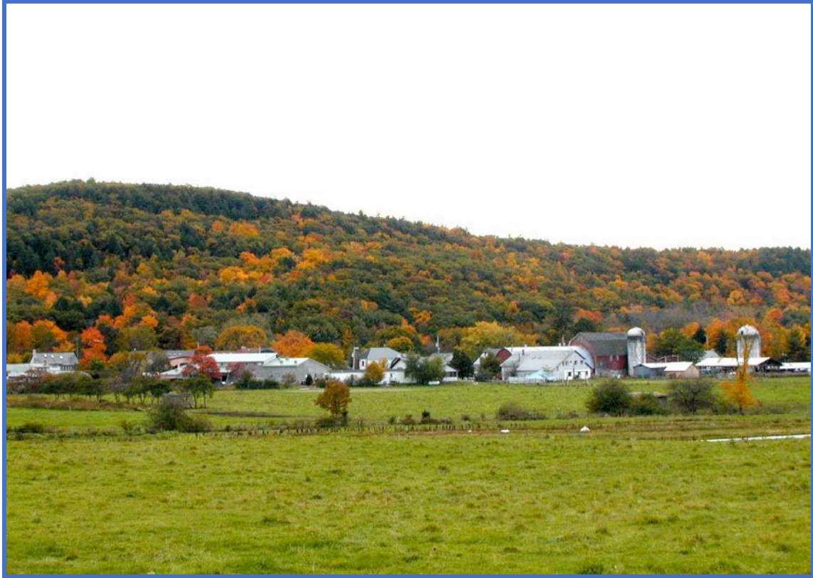
Hawthorne Valley Farm • Ghent, New York